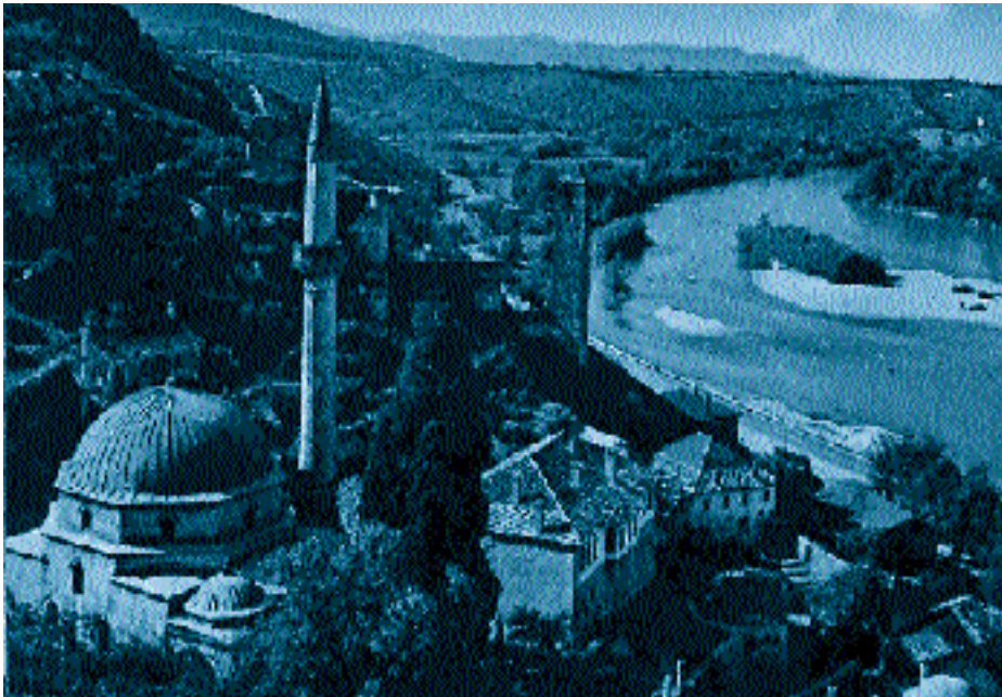
Mostar and Neretva river.