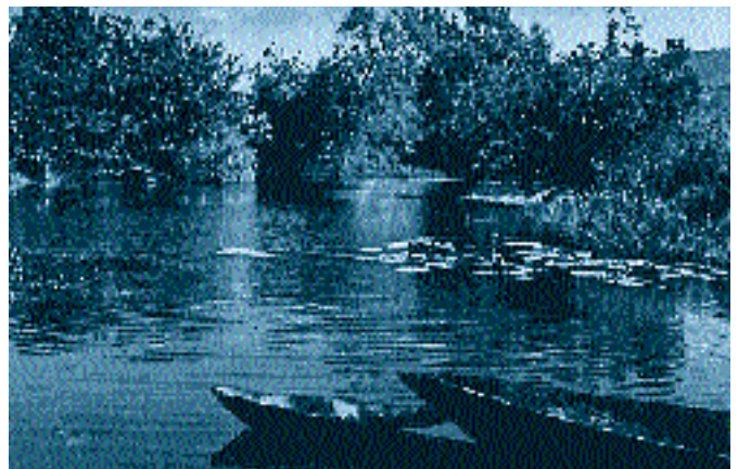
Hutovo Blato (Bosnia and Herzegovina).

· Deputy Minister Karavanja informed the participants about the starting transregional cooperation on the development of Adriatic river catchment basins, including 3 Counties on the Croatian side and 3 Cantons in Bosnia & Herzegovina. This will provide a general framework for transboundary cooperation in the lower Neretva valley and other, nearby international river catchments.